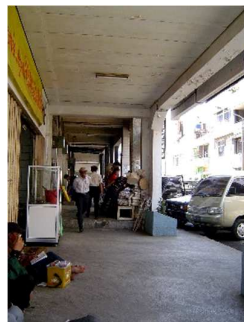
Figure 11 : Public Control To The Private Space in Commercial Area

Public-private domain sometimes becomes unclear when there is an intervention from the government. This occurs in a commercial area which is a row of buildings. Private territorial boundaries on this area claimed for public interest, so that the private rights on its territory been taken. In the picture below can be seen the pedestrian way in front of the shops. The shop owner actually still own the top area for residential use. But in this area occurs an unclear domain, whether it is public or private domain, while the street food owner feel has the rights to sell here.