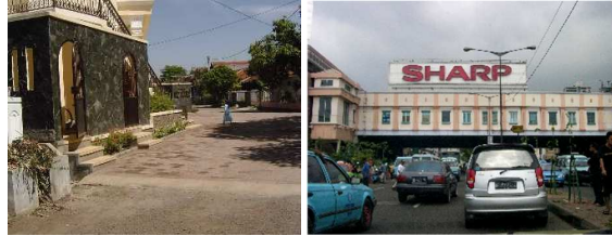
Figure 9 : Private Control To The Streets In Front of The Mosque (a) and Commercial Area (b) Through Permanent Intervention

The street, which is the circulation of vehicles, is clearly belong to public and no one has the right to change it, but the private control remains occur by changing the material as a territorial demarcation of certain building. One of the cases is a residential mosque in the picture below. Asphalt pavement is covered with paving block as a territorial demarcation of the mosque. The street closed with a portal and then becomes the mosque's yard. Another case is a consensus between the government and the private to build a pedestrian bridge above the street which is used as a commercial area. There is no one who feels disadvantaged, both street users and pedestrians. The pedestrians even feel more comfortable and secure to walking between the building through that bridge.