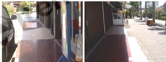
Figure 7 : Private Control To The Pedestrian Way In Front of The Shophouse Through Permanent Intervention

The second spatial conflict, that is the spatial conflicts caused by private control to public spaces through a permanent intervention, closely related to the realm of architecture because these conflicts are generally caused by the building design and layout which intervenes the public spaces. This conflicts occur in pedestrian ways, streets and open spaces. The conflict in the pedestrian way often occurs in multi-storey area, both residential and mixed-use building, such as the shophouses, flats and apartments. The division of the private-public domain has not been clearly understood by the residents and there is no governing law, so the residents also feel entitled to permanently change the things that should belong to public such as a pedestrian way in front of the shop. Pedestrian way was originally designed to have the same height and material, but then it was modified by the shop owner into a ramp so that the vehicle can be in and out easily. Some of them even expanded their shop to the front porch. As a result, pedestrians do not feel comfortable walking on this area.