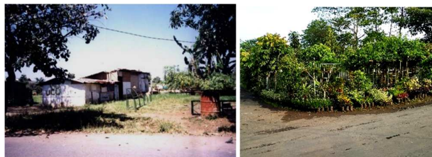
Figure 5 : Private Control To The Open Space Through Temporary Intervention

Other common conflict is a conflict in open spaces. Urban open space was originally planned as the lung for the city, greening, water infiltration, social activities, sports, and relaxation for the people. Meanwhile, there are certain people who think that as long as the function has not changed, which is still as greening, then the open spaces can be used to sell the plants. Therefore, the plant sellers began to sell their products in the open space which led to the loss of the functions of that open space as social activities, sports, and relaxation. There's even more negative effect such as the growth of non-permanent houses as a seller's dwelling place.