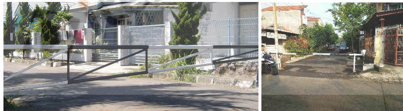
Figure 4 : Private Control To The Street in Residential Area Through Temporary Intervention

The conflicts that occur in the street is generally caused by consensus or agreement of certain dominant group that persuasively influences the society. Therefore, although there are certain groups in society who do not agree, they will still accept that consensus. A case in point is the street in residential area which its circulation pattern has been changed by certain group of residents because of safety factor by installing street portal. The residents should not have the rights because that street is not only used by the residents but also by a non-residents.