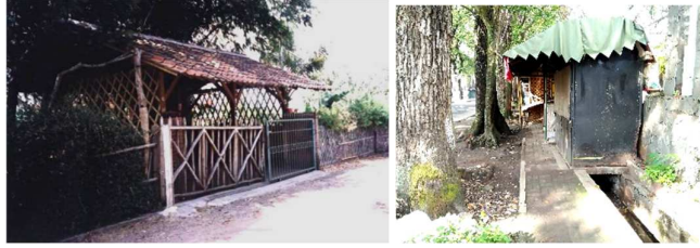
Figure 6 : Private Control To The Green Belt (a) and Drainage (b) Through Temporary Intervention

The conflict in the green belt, the space between the river and the built area that serves as a water infiltration, is often occurs in urban area especially in residential area. In our society, the tendency to occupy that area usually done by the lower class who do not have a place to live, but it turns out that this is also done by the middle class who use that area as their garage. This reality is happening without public consensus but done by individuals and not for the common interest.