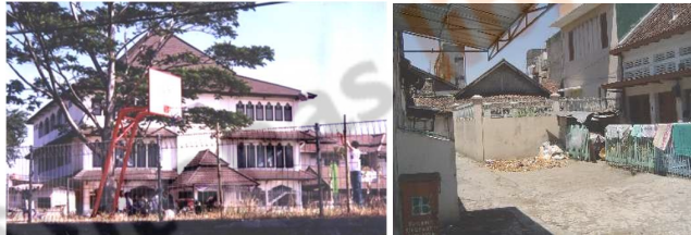
Figure 10 : Private Control To The Open Spaces Into The Mosque (a) and House (b) Through Permanent Intervention

The open space in urban areas was originally planned for social activities, aesthetic and environment, but the need for a land often forces government to changes these functions into other functions. One of them is as a worship facility. The reality shows that some open spaces in the city were changed into mosques and this change was made by the people who incorporated to a foundation. Government as an institution that grants a permit can not reject this permission even if it is illegal or against spatial plan and regulation. This is because of the government's reluctance to things that related to religious worship. Other spatial conflict in open spaces also occurs in high-density residential area that has an unclear property boundaries. This makes the side of the building exceeding the plot boundaries and uses some part of the open space.