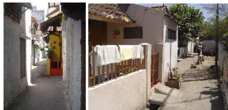
Figure 8 : Private Control To The Streets In Urban Kampong Through Permanent Intervention

The Spatial conflicts on the streets through permanent intervention are often found in the urban kampong. Façade expansion that intervenes public spaces (the street or alley) is generally occurs at high-density settlements with an unclear building orientation. Sometimes the facade, the back and the side of the building is facing the same alley. Territorial boundaries and plot ownership can't be seen clearly so that the public-private domain becomes blurred. A building code such as Building Coverage Ratio (BCR) and building density are difficult to enforced in the urban kampong that grows organically like this. The width of the alley is narrowed because of control from one of the residents, followed by other residents until the end of the alley, is this a public consensus for the common interest?