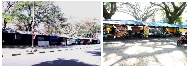
Figure 3 : Private Control To The Pedestrian Way Around Sports Field And City Park Through Temporary Intervention

The first spatial conflict, that is the spatial conflicts caused by private control to public spaces through temporary intervention, often occur in a pedestrian ways, streets, open spaces, green belts and drainages. The conflict in a pedestrian ways is generally caused by a multiplier effect around activity center that generates a great attraction. A case in point : A sports field can trigger the existence of street food carts surrounding it. Those street food carts take place in public domain so that the pedestrian's rights was taken.